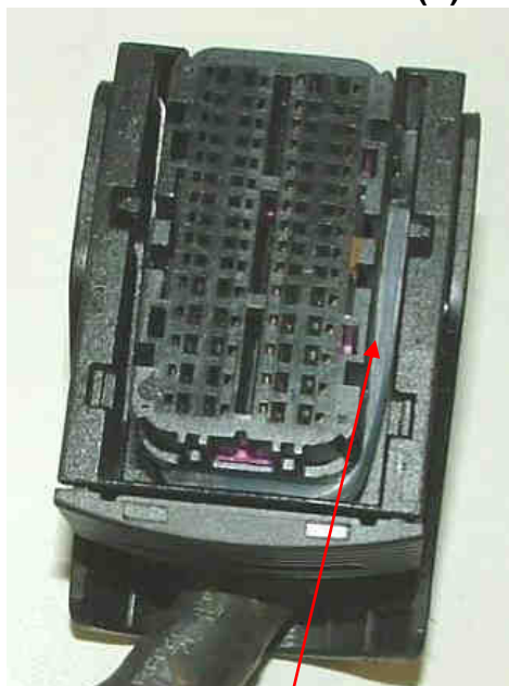
Small connector (A)

To get the right reliability of both connections, we recommend to pay attention about the conditions of each seals. After some disassemblies of the ECU (to limit as possible), the seals could be damaged, or cut (as shown on pictures below).